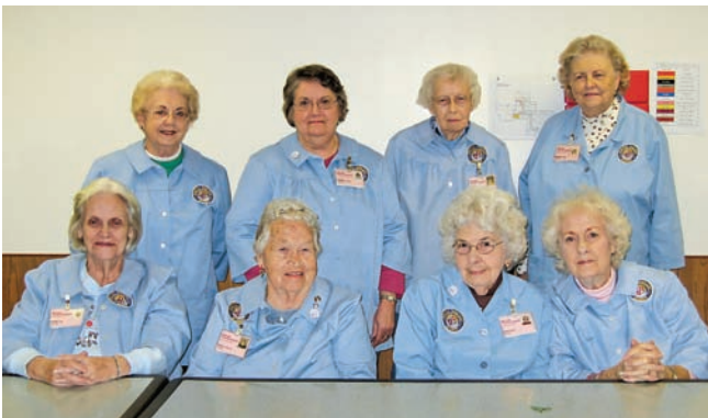
Flamingo Twig Members

Fundraising is a major part of their commitment to the hospital. They conduct garage sales and are known for their delicious bake sales at the hospital site with the monies raised from events being applied to the purchase of items needed for patient care.