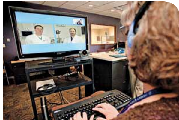
eICU – A look inside the OhioHealth eICU where their physicians and nurses can actually see local patients as they evaluate their condition, view test results and confer with local physicians.

For more information about the OhioHealth Stroke Network, go to – http://www.ohiohealth.com/strokenetwork .